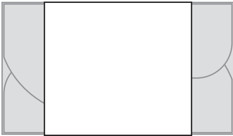
Print Position - TOP